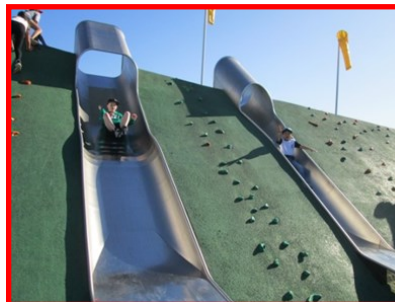
Riverside Park - Slippery slides