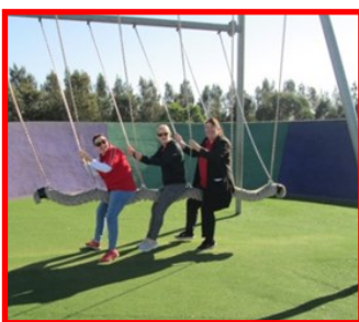
Riverside Park - Swing Logs