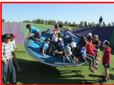
Fun at Riverside Park