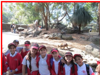
Checking out the Kangaroos

'I laughed so much and smiled' - Mico 4S