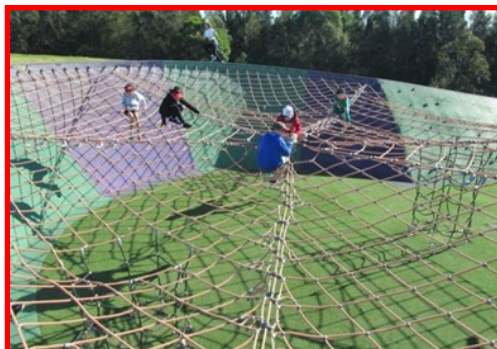
Riverside Park—Spider nets