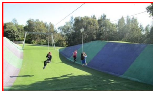
Riverside Park—Flying fox